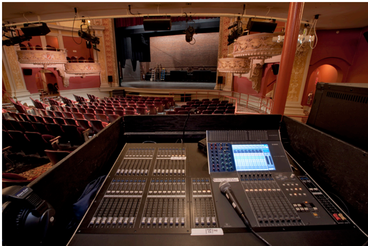
Front-Of-House Mix/Control Position View from Audio Console to Stage (Yamaha M7CL, 32-Channel, Digital Console)