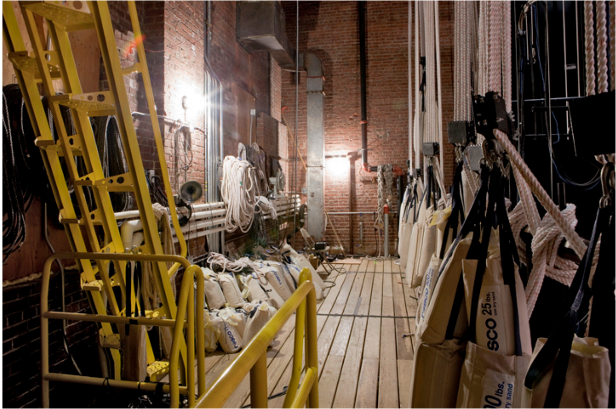
Operating Fly Gallery, Stage Left Manual, Hemp-Line/Sandbag System