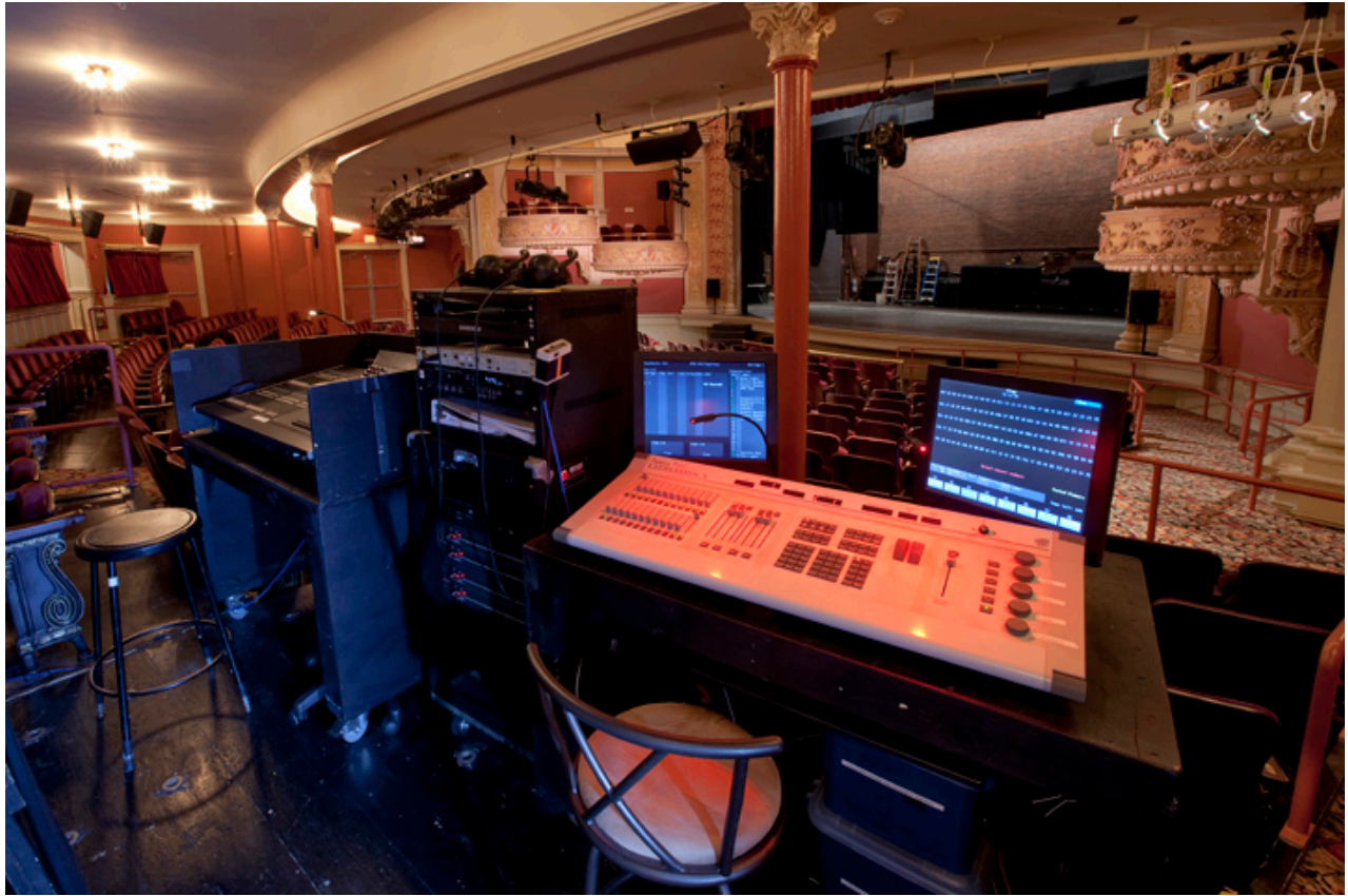
Front-Of-House Mix/Control Position Showing Venue Lighting and Audio Consoles (ETC Expression 3 and Yamaha M7CL Consoles)