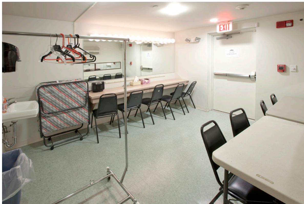
2 nd Floor Dressing Rooms (2, Both From Stage Left)