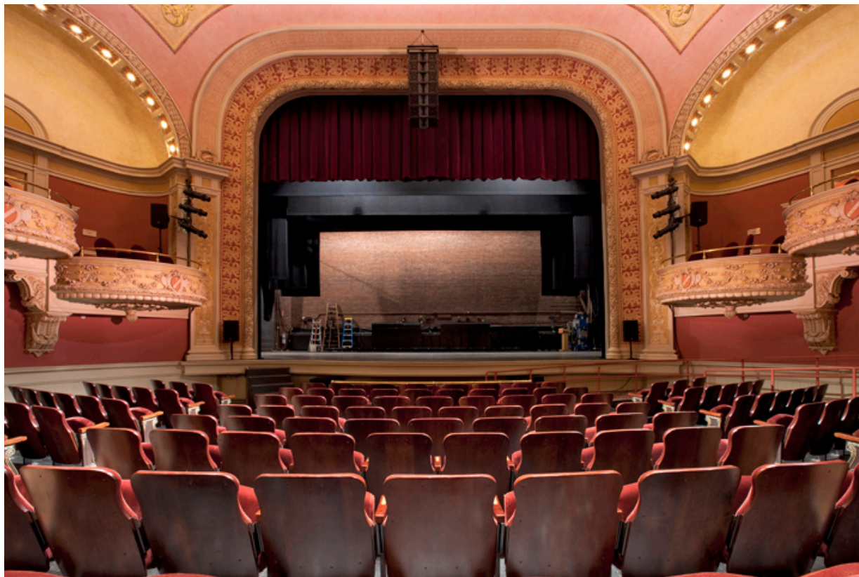
Tech Table Row, Center Orchestra Section View to Stage (Tables Span Rows G and H, Personnel Sit in Row J)