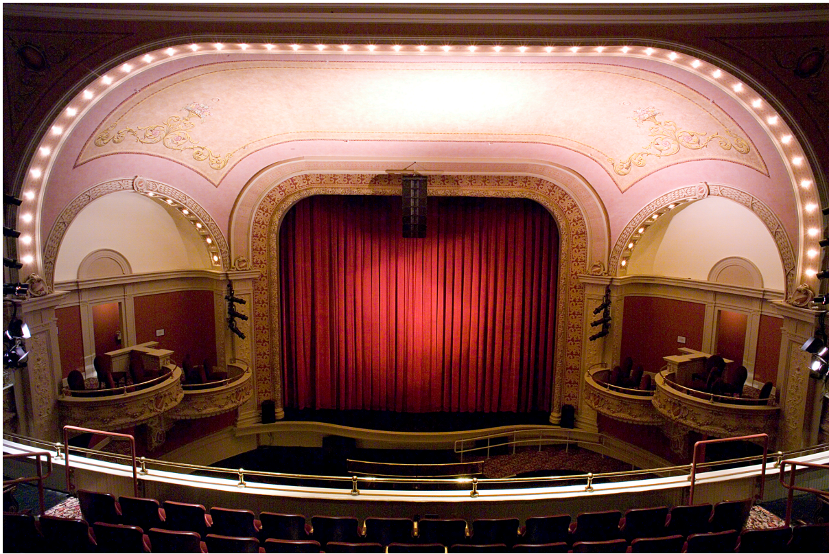
Stage Viewed from Balcony, with Main Curtain In