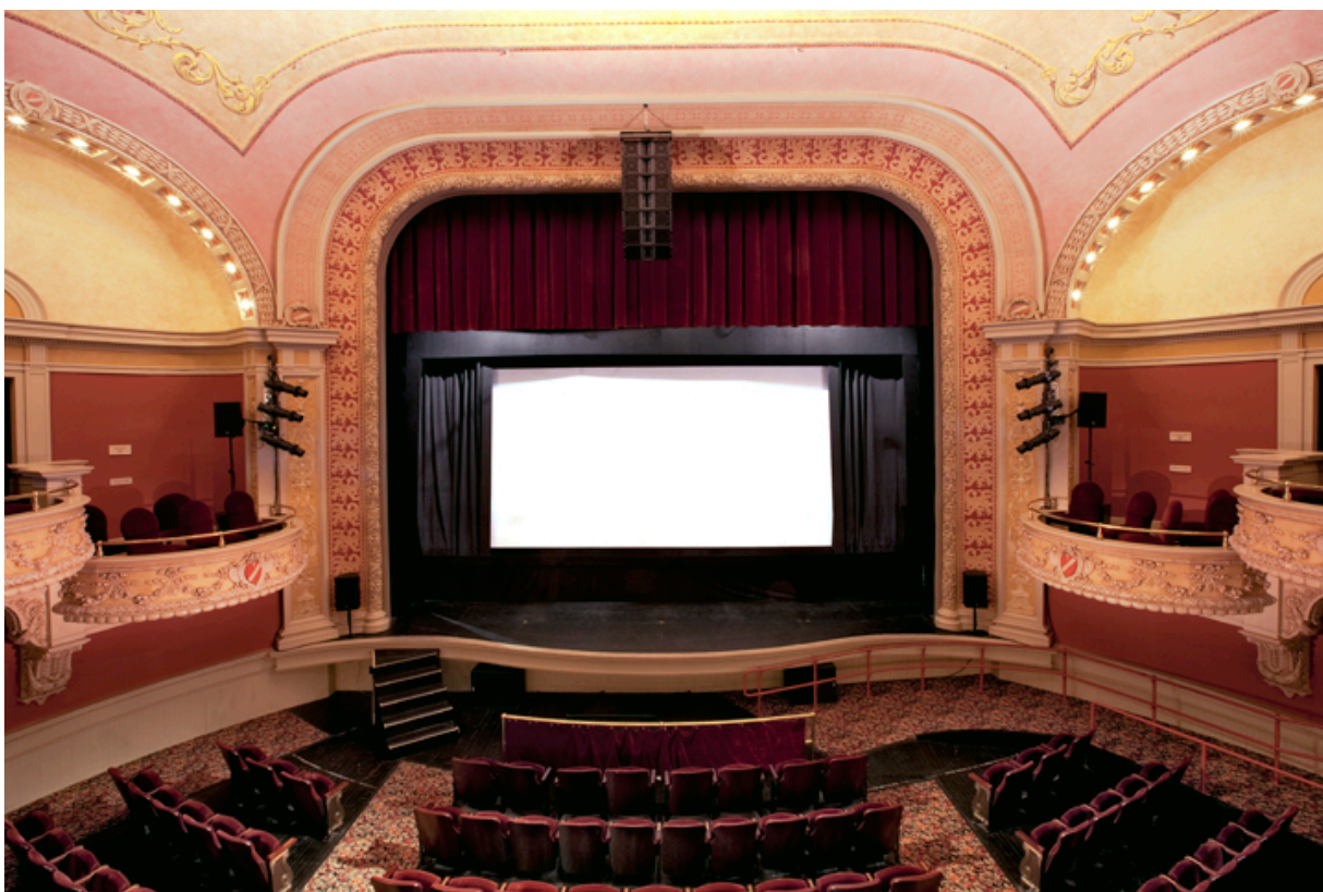
Stage with Film Screen In, Viewed from front of Balcony