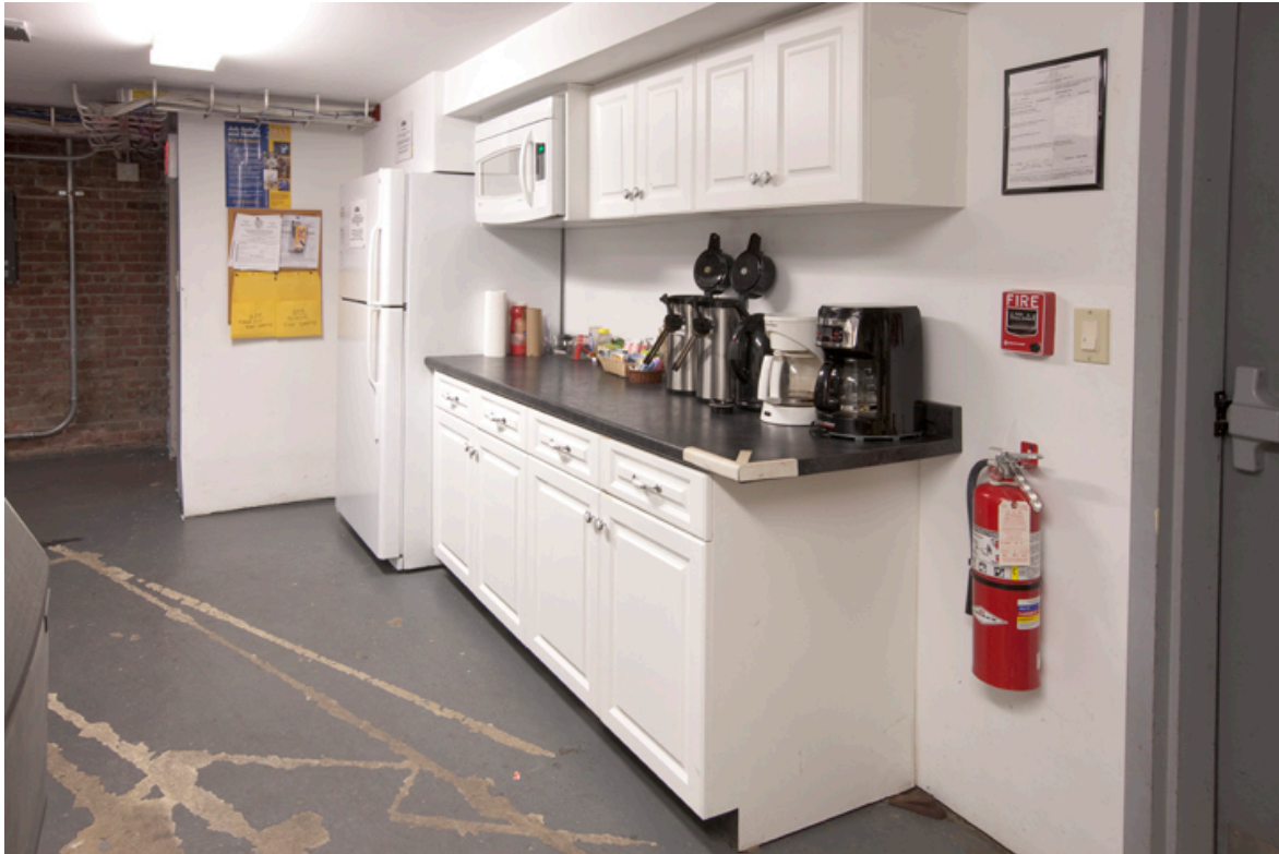
Green Room Kitchen