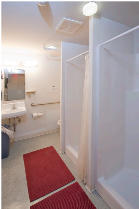
Dressing Room Bathrooms (1 st Floor and 2 nd Floor)