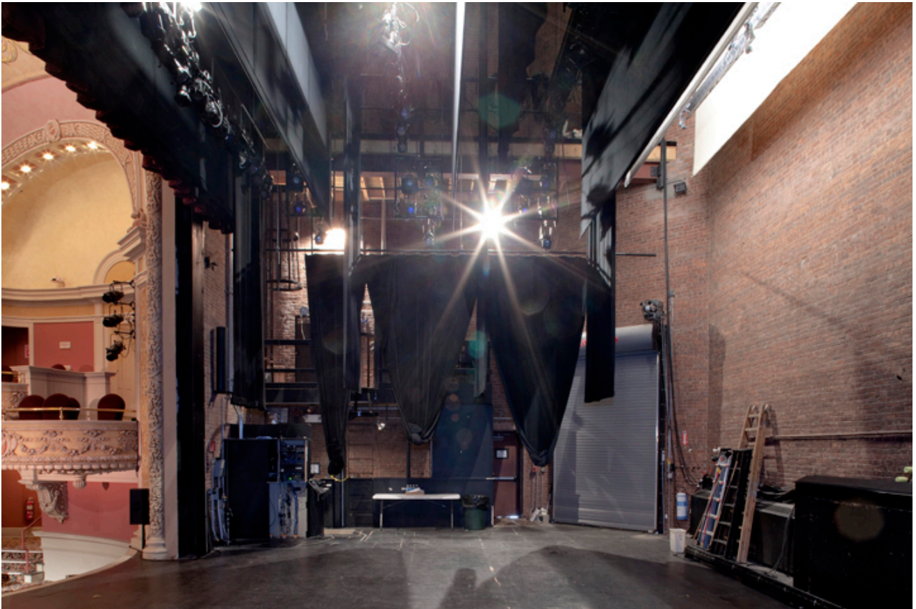
Stage Right Wings, Viewed from Center Stage