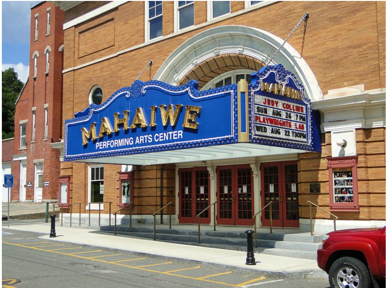
Theater Exterior Castle Street (Coming from Main Street, Route 7)