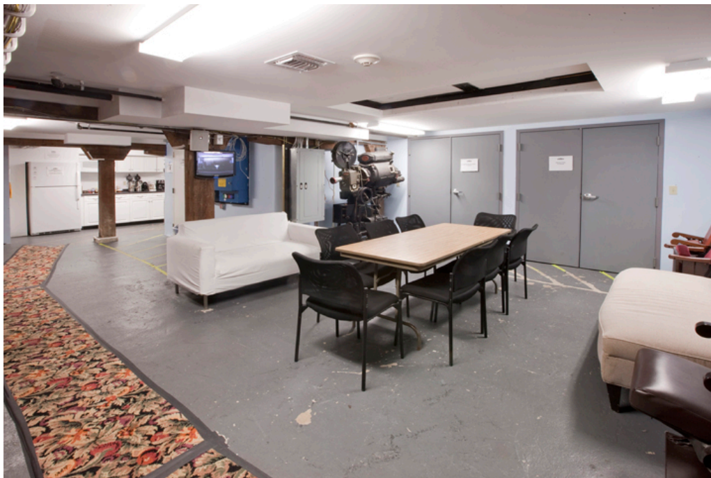
Green Room, Under the Stage