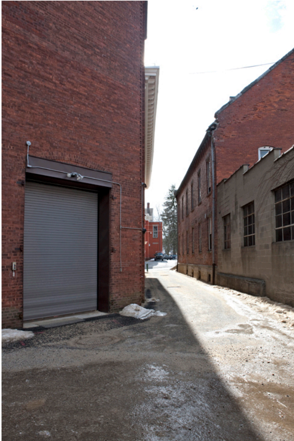
Load-In Access Alley Loading Door End of Alley