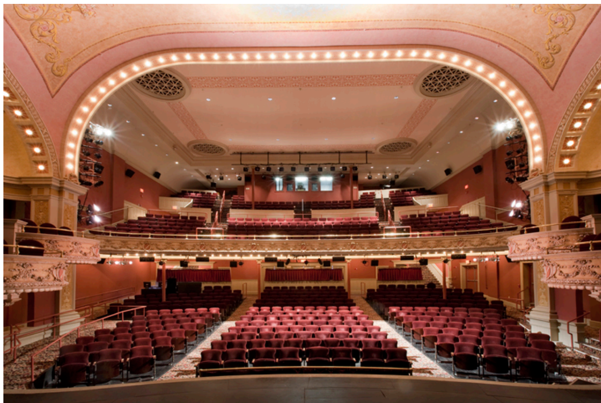
Auditorium, Viewed from Center Stage