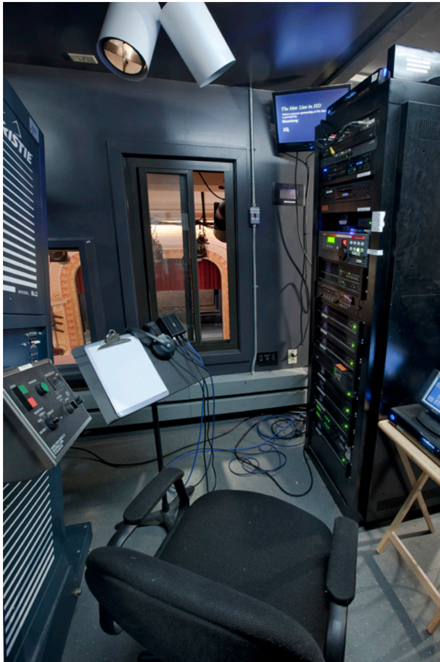
Projection Booth, Projectionist's Control Position (Can be Converted to Live Event Control Position also. For either Lighting and/or Stage Management)