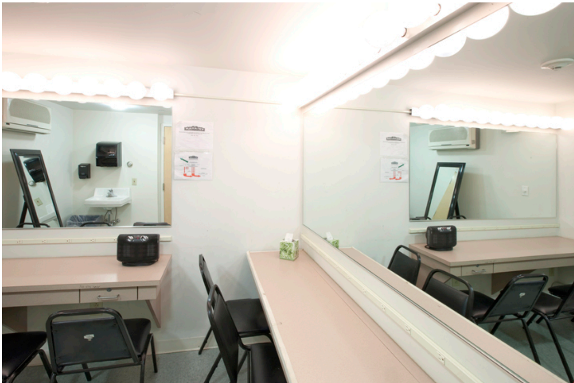
1 st Floor Dressing Rooms (2, Both From Stage Left)