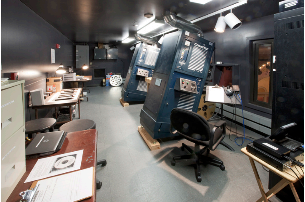
Projection Booth Digital HD Projectors Live Between the 35mm Machines