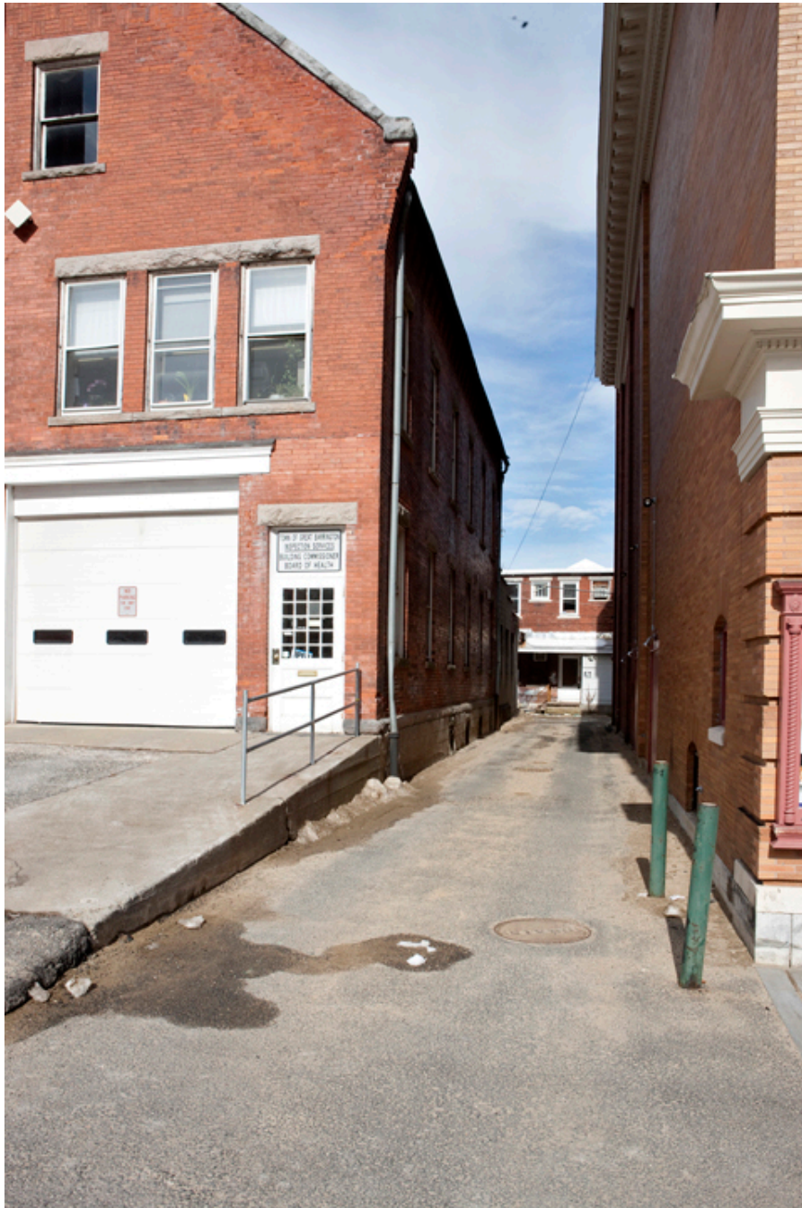
Load-In Access Alley Castle Street End of Alley