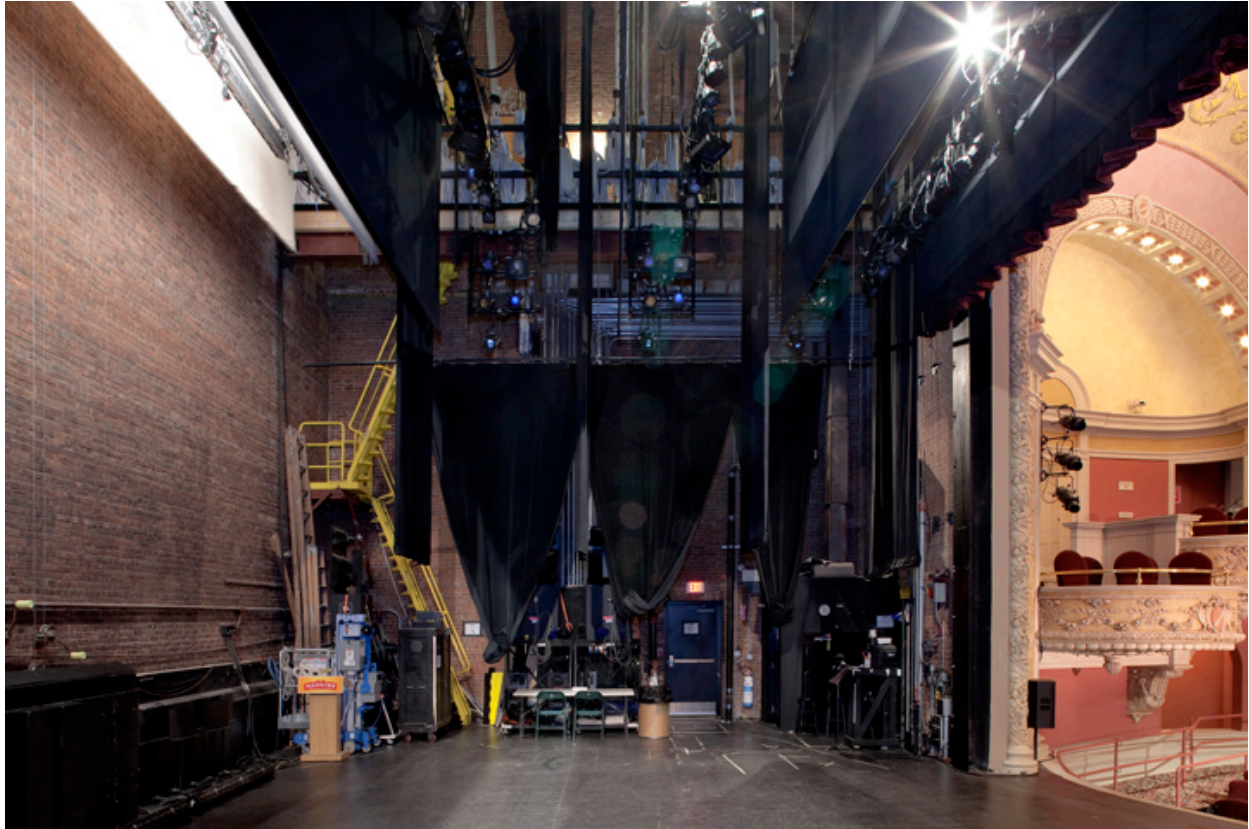
Stage Left Wings, Viewed from Center Stage