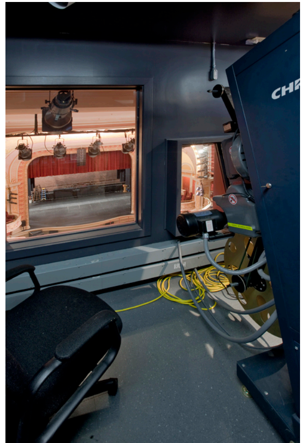
Projection Booth Windows, View to Stage