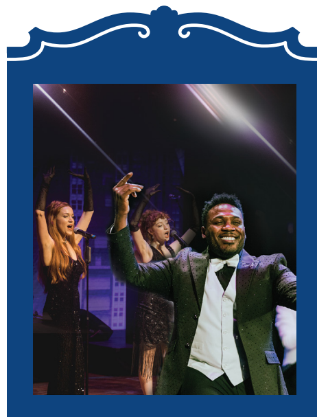
Scott Bradlee's Postmodern Jukebox: