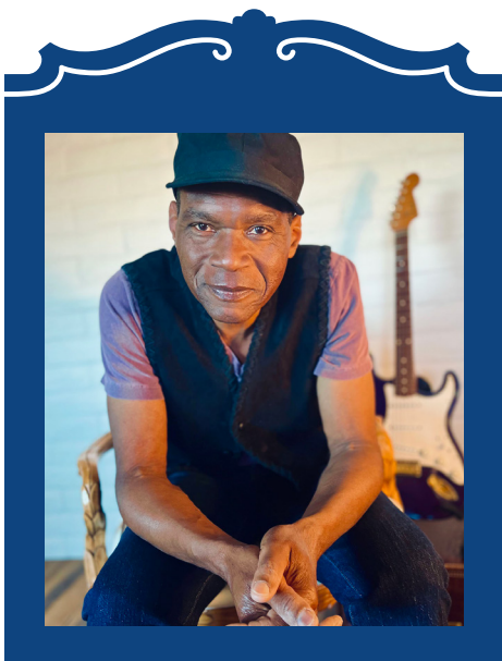
The Robert Cray Band