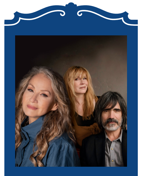
Joan Osborne with Special Guests