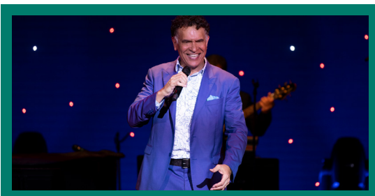
2023 Gala with Brian Stokes Mitchell