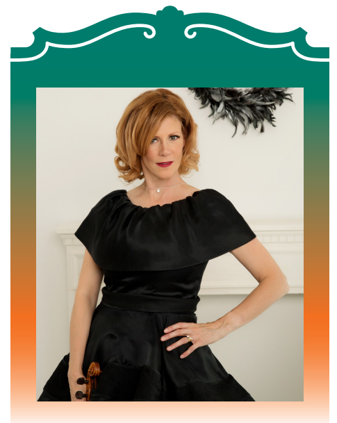
Natalie MacMaster & Donnell Leahy Celtic Christmas Sunday, December 17 at 7 pm