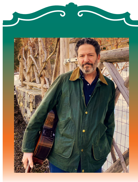
John Pizzarelli Stage & Screen Saturday, December 16 at 8 pm