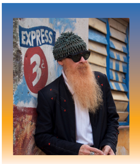
Billy F Gibbons Saturday, February 15 at 8 pm