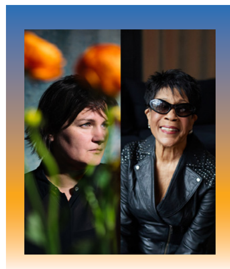
Madeleine Peyroux & Bettye Lavette Let's Walk Tour 2025 Friday, May 16 at 8 pm